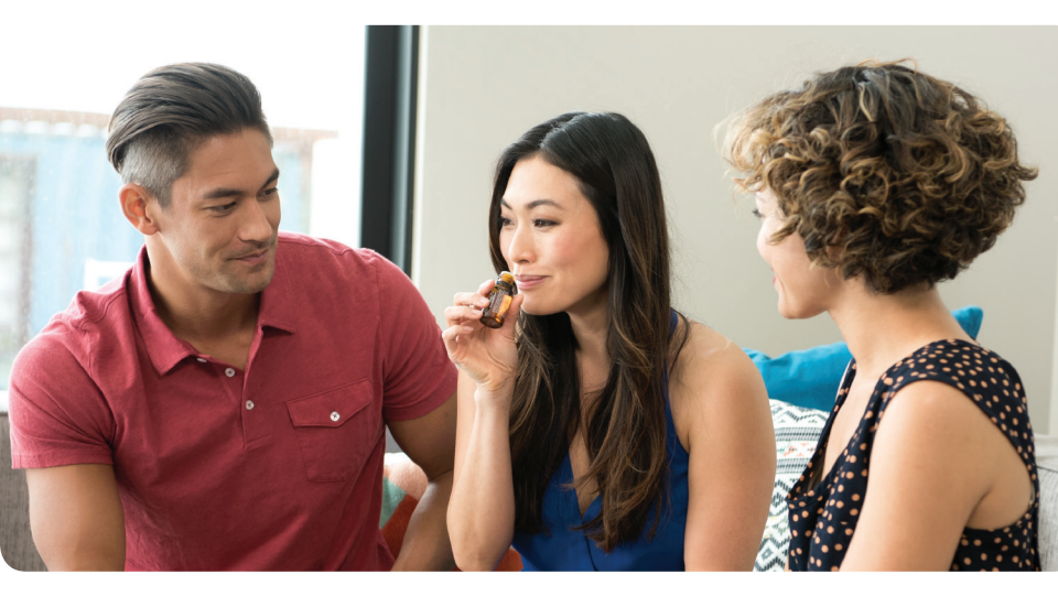
Connect with the person who gave you this guide to learn more.

There are so many possibilities available to you by using dōTERRA solutions. Living healthy really can be simple.